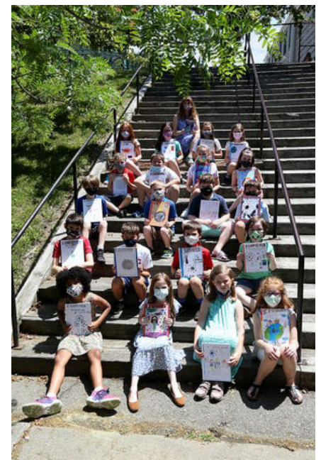
The Jenkins School project is based on a popular book series, called "I Survived."

He also enjoyed "I Survived the Sinking of the Titanic, 1912."